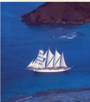
Journeys of Paul Cruise July 3–12, 2009