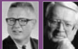
Charles R. Swindoll CLASS OF '63 Pastor, Stonebriar Community Church President, Insight for Living Chancellor, Dallas Theological Seminary